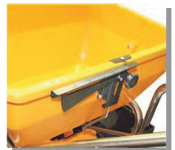
Adjustable flow rate dial